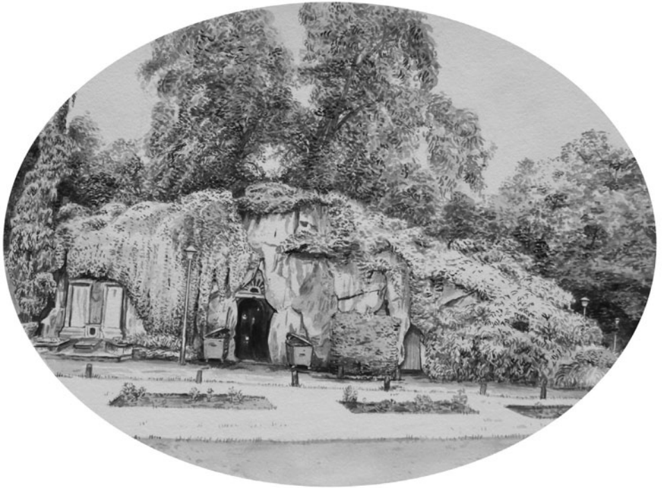
Figure 6. The Hermitage of the Citadel-park