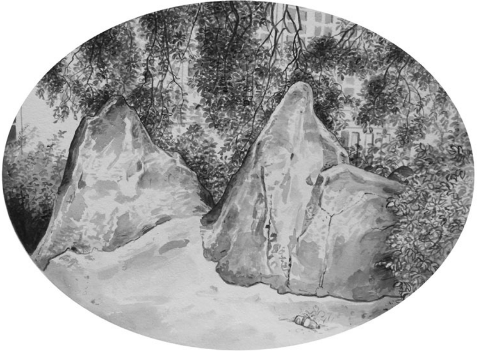
Figure 4. The Rocks of the Citadel-park