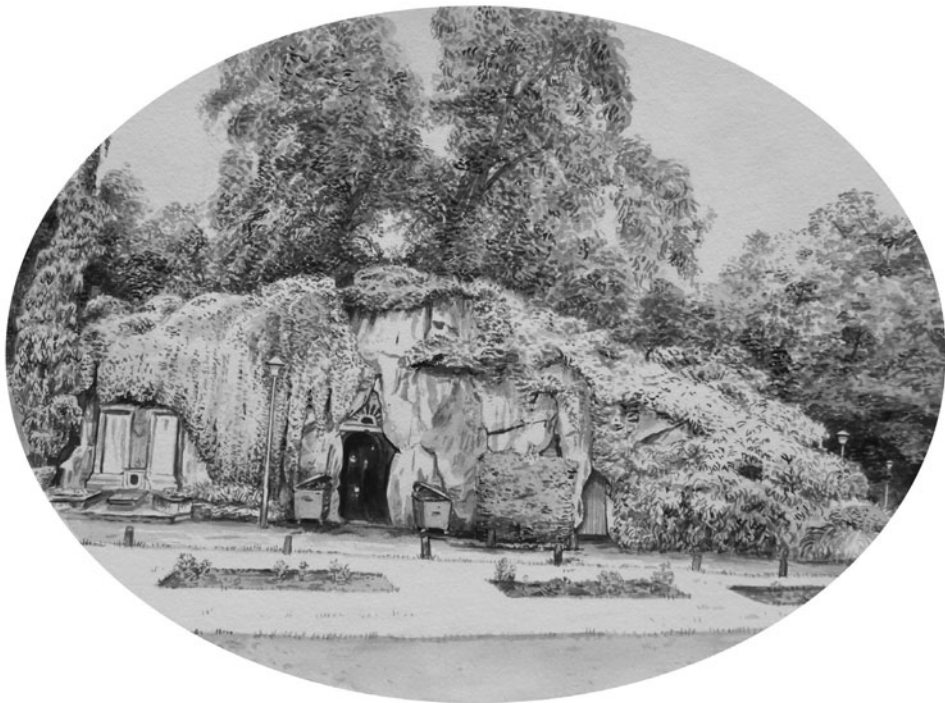
Figure 6. The Hermitage of the Citadel-park