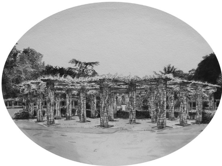
Figure 7. The Rose-Trellis of the Citadel-park