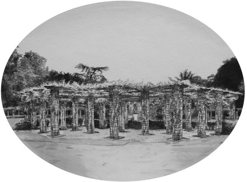
Figure 7. The Rose-Trellis of the Citadel-park