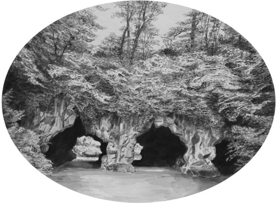
Figure 5. The Grotto of the Citadel-park