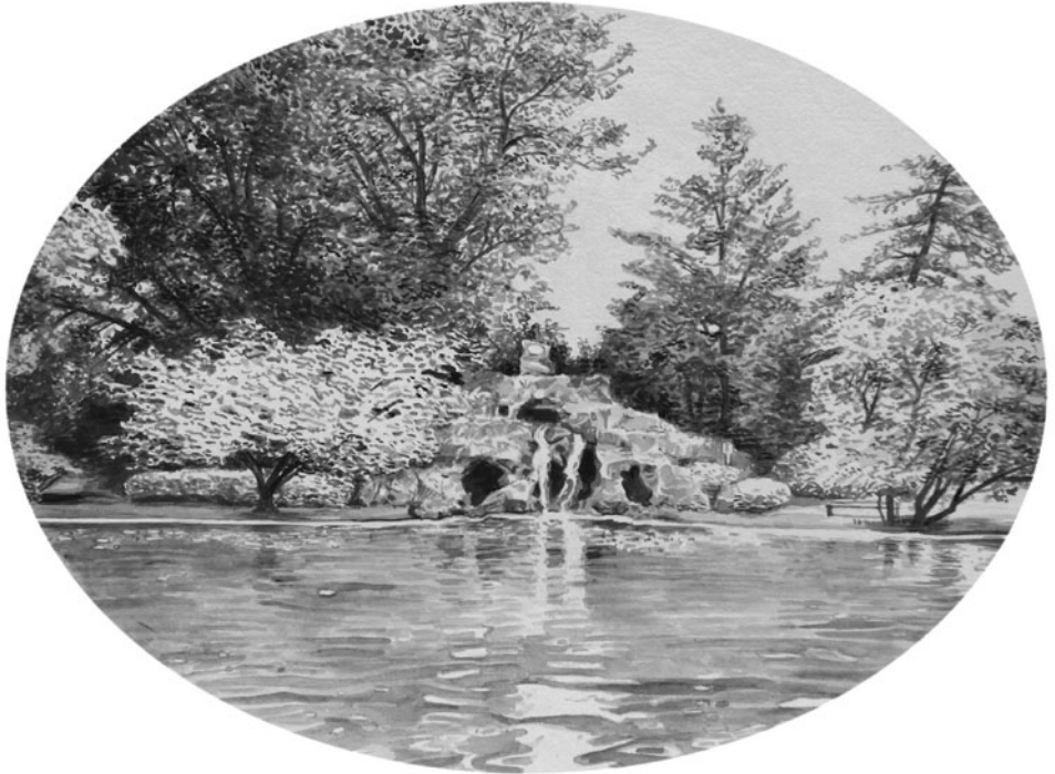
Figure 1. The Cascade of the Citadel-park