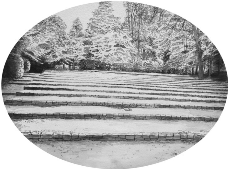
Figure 3. The Grassy Steps of the Citadel-park