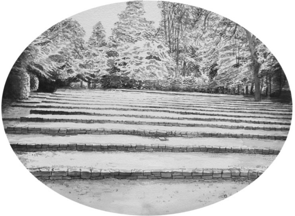
Figure 3. The Grassy Steps of the Citadel-park