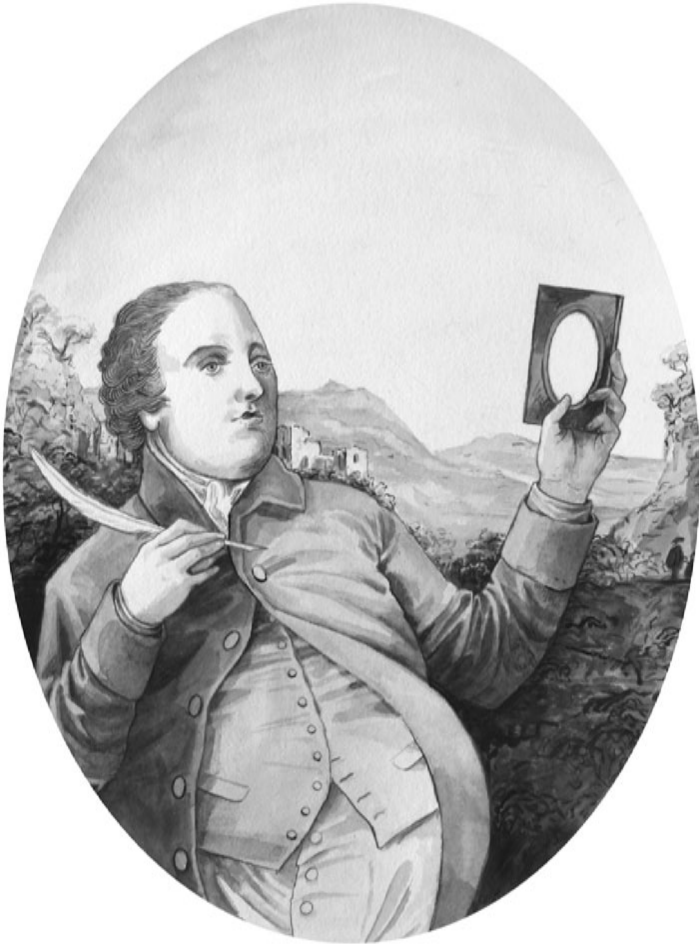
WILLIAM GILPIN door Ellen Harvey