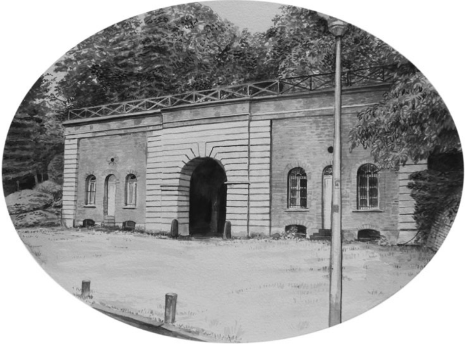
Figure 2. The Triumphal Archway of the Citadel-park