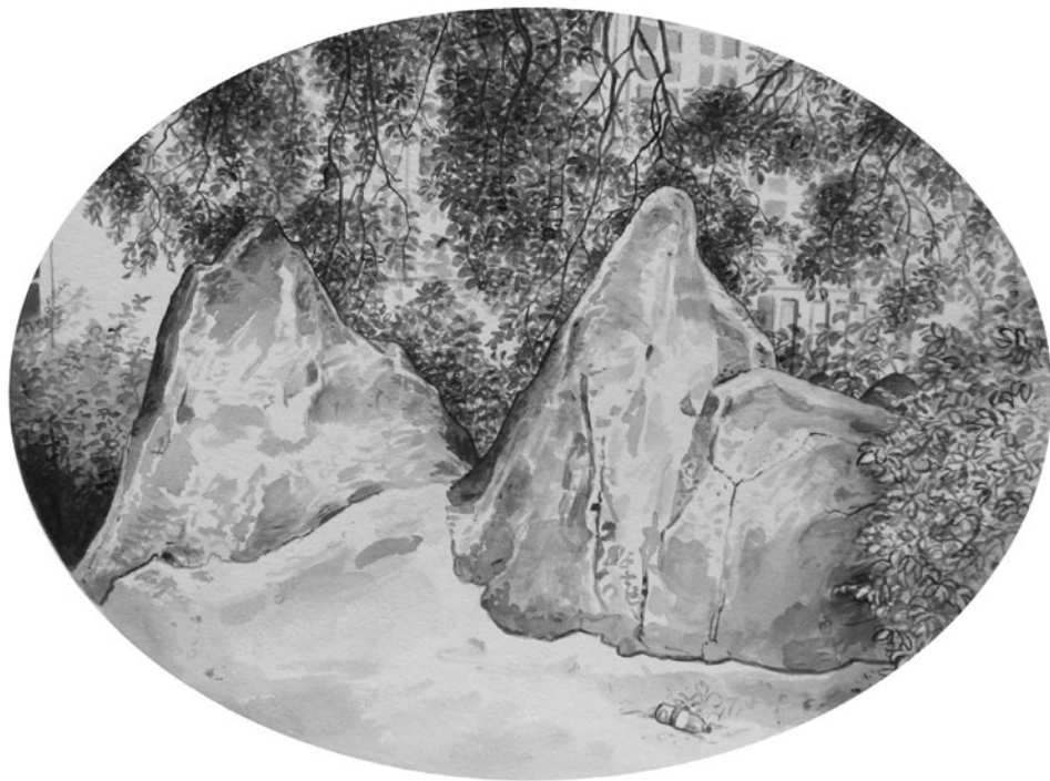
Figure 4. The Rocks of the Citadel-park